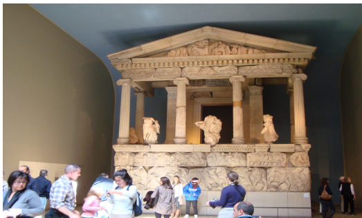
Greek part of the museum

In the Greek part, we saw sculptures with a lot of details, and their faces express their feelings. The Roman part was very similar to the Greek part but with more evolution in the sculptures. Next, we saw the Medieval period part and the daily life of this period.